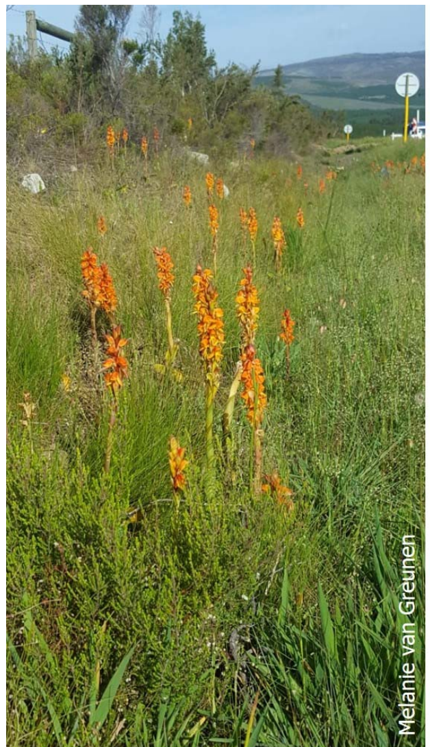
Satyrium coriifolium along the N2 highway

We have in the past year had quite considerable interaction with the public – amongst other things dealing with the widening of the N2 that was potentially threatening a large colony of Satyrium coriifolium in the Cape. This fact was brought to our attention by a concerned member of the public.