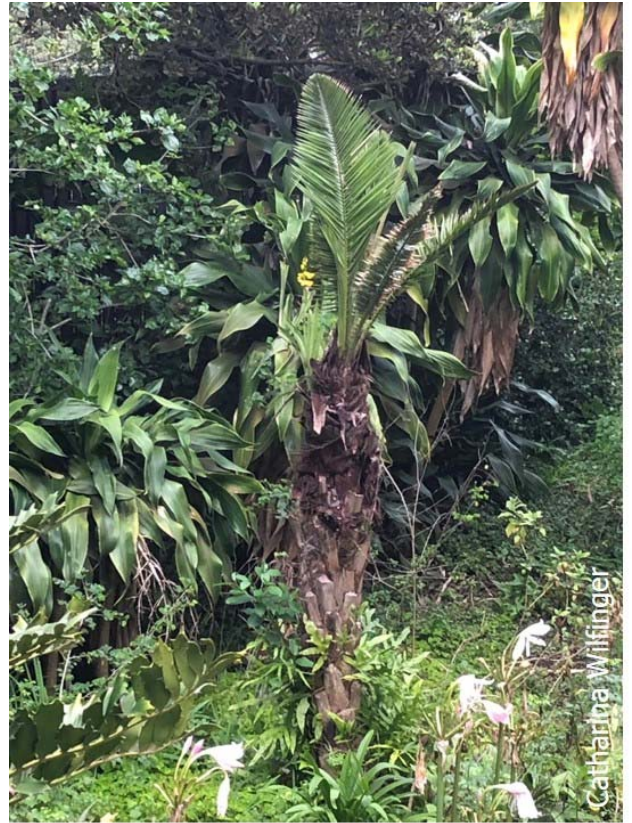
Eulophia speciosa now also grows on palm trees in KwaZulu Natal!